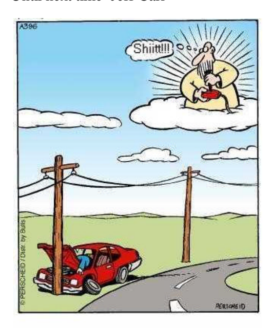
Happy Flying, Jim